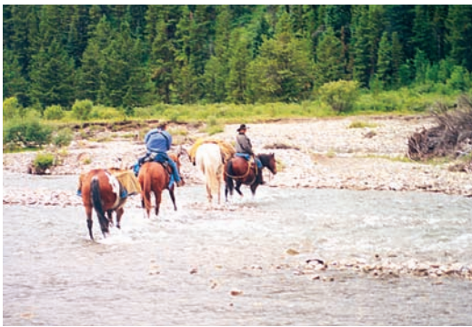
Traditional uses of public lands are threatened by ever increasing restrictions.

We see it all the time right here in Alberta with the creation and expansion of provincial and wildland parks, most born under the pressures of these same groups who have a grand vision of human population control.